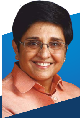
Hon. Dr. Kiran Bedi