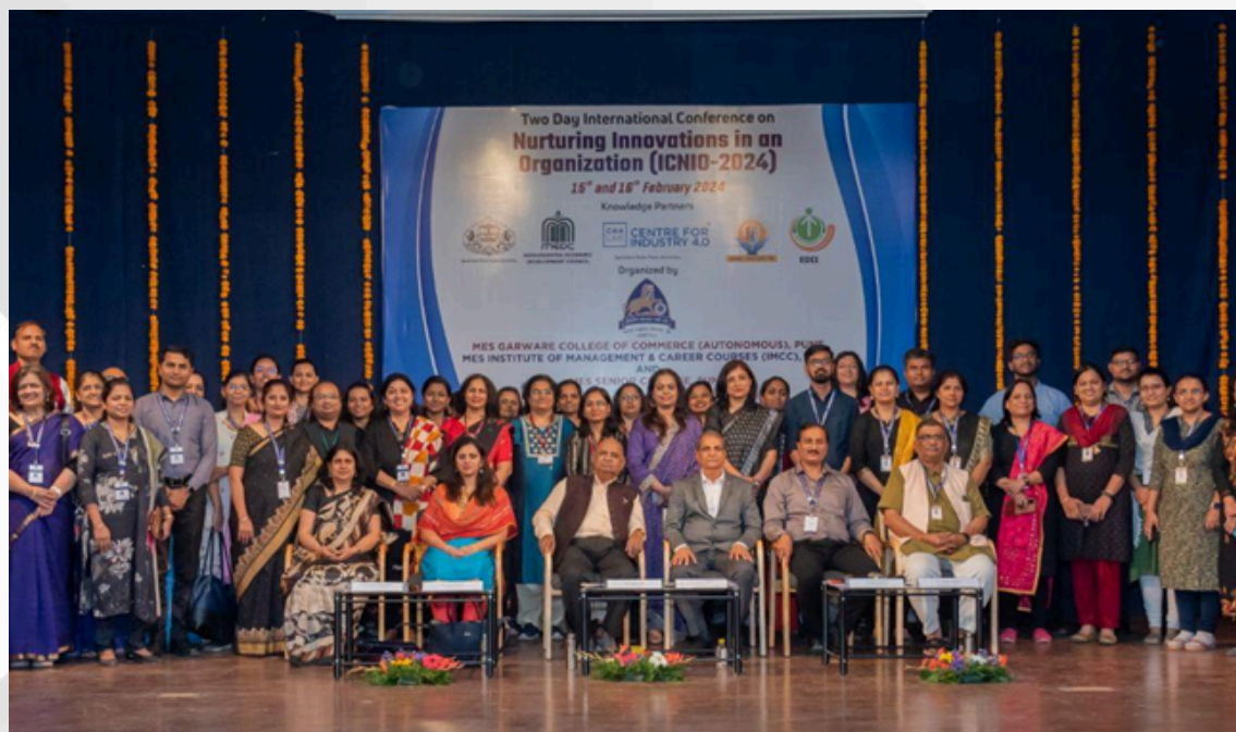
Two-day International Conference on Nurturing Innovations in an Organizations (ICNIO-2024) .