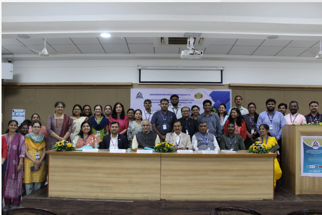
A Two-day International Conference on Innovation for Inclusive Growth, Development & Sustianability.