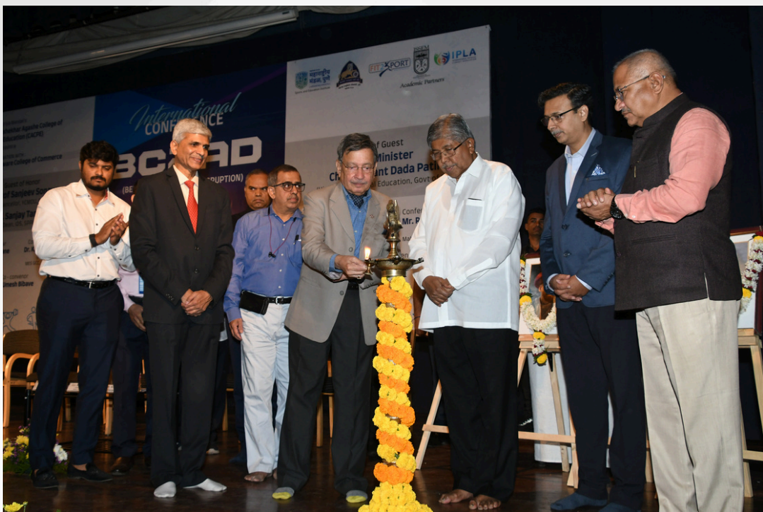
Inauguration of International Conference on BC2AD (Before ChatGTP to AI Disruption).