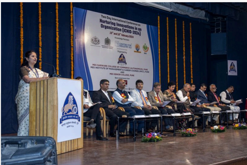
Dignitaries on the Dias for the International Conference